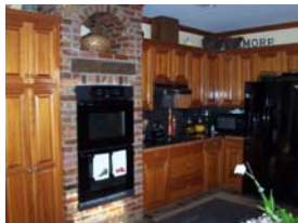
Kitchen (Double Oven)