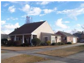
West Side of Home

Inspection: Tuesday, January 24, 6-8 p.m.; Tuesday, January 31, 6-8 p.m.; and one hour before auction.